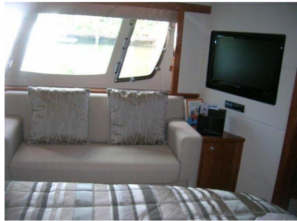
Master Stateroom Seating