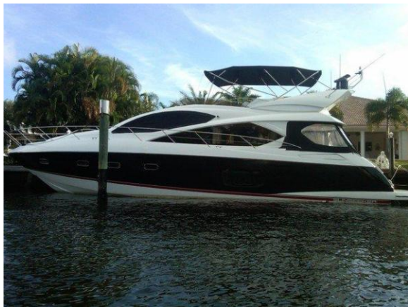
Port Side Shot