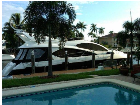
Starboard Side Shot