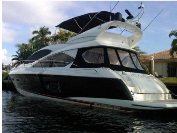
Port Side Shot